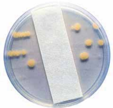
With Microban® protection